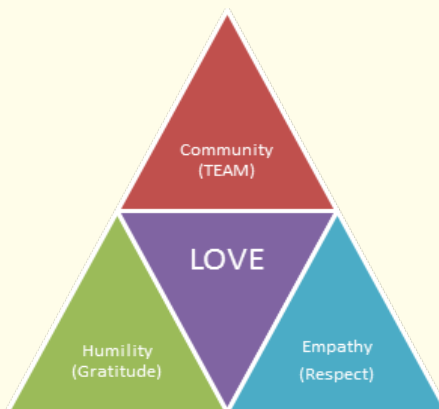
Figure 4: The Authentic Self.

Have you ever watched people who while in the midst of chaos are still able to exude calm? This is DISCOVERY, where we come to know the difference between what we can control and what we can't. At this point, how we respond to the chaotic situation is based on a choice. Our choice is based on the state of our heart. There are only two foundational emotions in life: fear and love. If our heart is based in the fear, the chaos continues. But if we can make the shift to open our heart to love, we move to experience authenticity (Figure 4). "There is no fear in love. But perfect love drives out fear" (1 John 4:18).