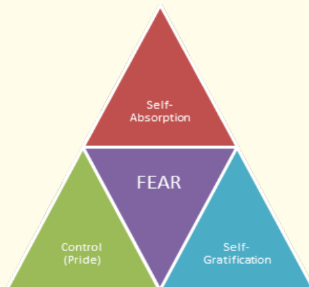
Figure 3: The Shame False Self.