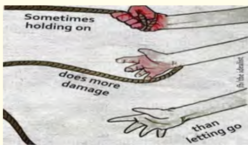
Figure 5: Letting Go.

The fact is if we take ownership of our truth, regardless how brutal it may be, it no longer has the power to dictate or dominate the emotional fate of our lives, and peace with ourselves is at our heart's door. Forgiveness and letting go are the keys which allow us to walk in peace (Figure 5).